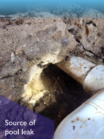
Source of pool leak