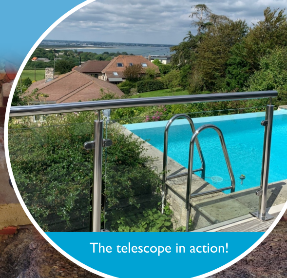
The telescope in action!

We can verify the water leakage by slightly refilling the pool and then releasing a special syringe of purple dye around the area of suspected leakage. Should the purple dye pull away we can be fairly certain that this is indeed an area of leakage and set about repair.