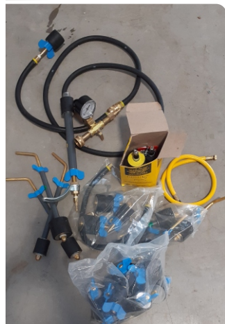
Leak detection pressure kit

Sometimes, looking for the source or sources of leakage is like looking for a needle in a haystack. We are handicapped in our detective work as we just don't know what builders have done, or rather, not done when building the pool which may have been many years ago. The Pool Doctor recalls one occasion where the builders had incorrectly plumbed the sump pipe into the second hole at the bottom of the skimmer, so the sump hadn't