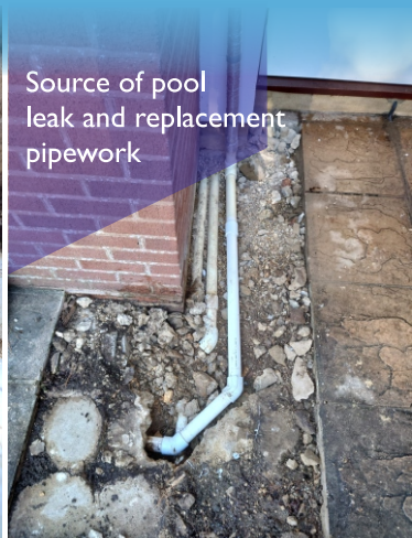
Source of pool leak and replacement pipework